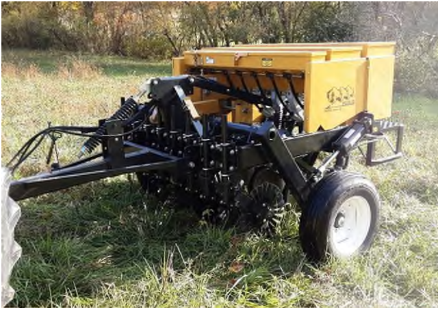
WCCD Truax No-Till Grass Drill