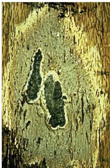
Figure 1. Fungal mat of oak wilt disease.

Symptoms can be the same as those of red oaks with quick mortality, but typically, white oaks die slowly over several years, with only a few branches showing symptoms and dying per year. The leaves often remain attached with discoloration only at the margins. Other times, however, white oaks seem to recover. Brown to black discoloration commonly develops in the outer sapwood of infected white oaks (fig.5). This symptom is less common in infected red oaks.