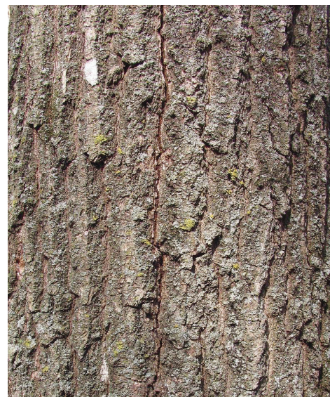
Figure 2. Cracked bark caused by fungal mat of oak wilt disease.