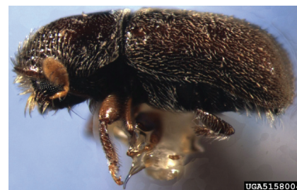
Figure 9. Adult oak bark beetle.

Disease Cycle —Root grafts and insect vectors spread the oak wilt fungus. Root grafts are an effective means of transmitting the fungus from infected to nearby healthy trees. These grafts are a major factor in local spread of the oak wilt pathogen, especially in areas with deep, sandy soils and where oaks grow close together (fig. 6).