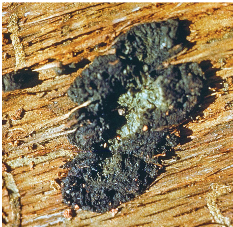
Figure 7. Older fungal mat with bark beetle galleries.