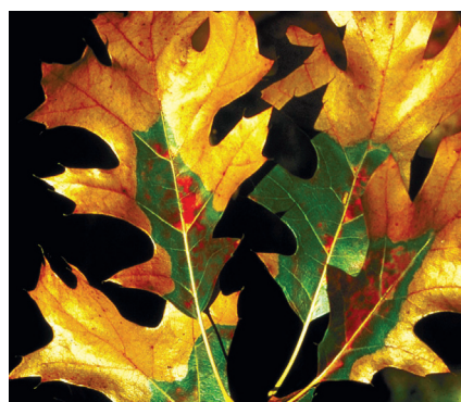
Figure 3. Oak wilt symptoms on red oak leaves.