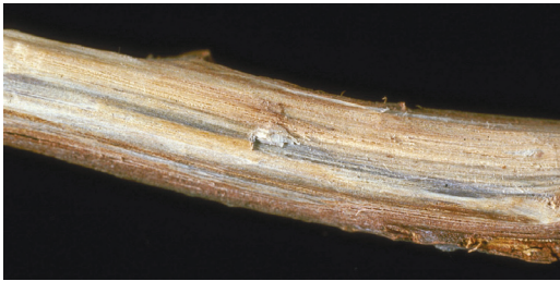
Figure 5. Black streaks in the new sapwood caused by oak wilt disease.