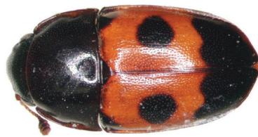
Figure 8. Adult Nitidulidae beetle.