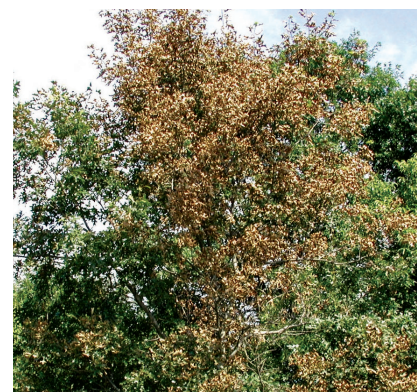
Figure 4. Typical crown symptoms of oak wilt on red oak.