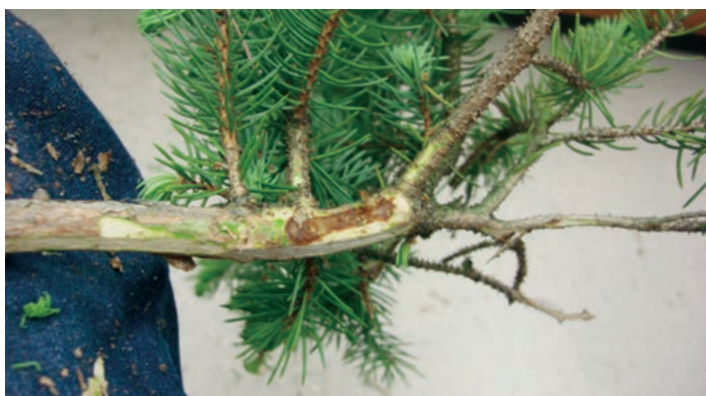
Figure 5. Typical canker on branch of spruce tree observed in Figure 2. The bark was removed until the canker was discovered. Then, tissue on the edge of the canker was cleaned and sterilized and placed on culture medium. Phomopsis was cultured from this canker and others on the branches of the tree in Figure 2. The branch still shows some vigor, but as the canker enlarges, the vigor of the branch will probably decrease.