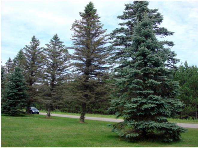
Photo 1. Mature landscape trees showing varying amounts of spruce decline. If you look at the base of the healthy tree on the right, you can begin to see branch death.