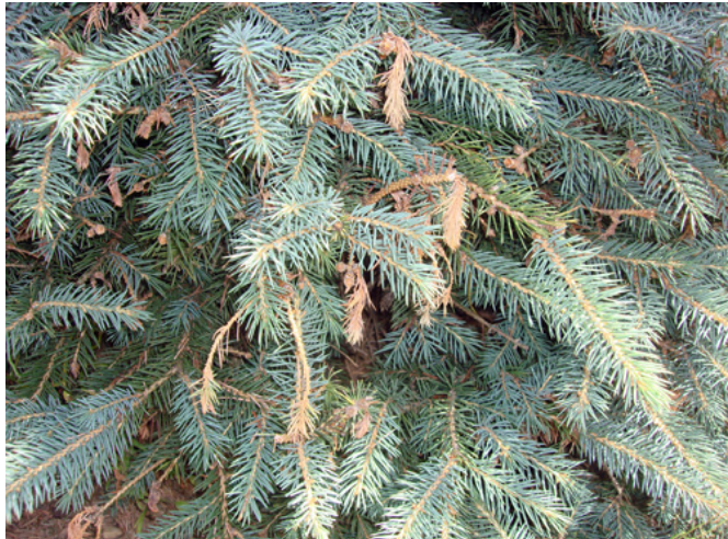
Photo 3. On some trees, you may be able to see typical Phomopsis infection symptoms where new growth curls downward and dies.