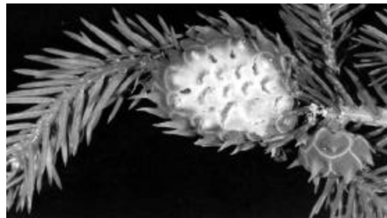
Open new gall

expanding buds. Feeding induces the formation of the galls, inside which the nymphs continue to feed and develop. In late summer (August through September), galls open and fully-grown nymphs emerge. These become winged adults, which can fly to nearby susceptible spruce trees. The adults deposit eggs, which soon hatch and give rise to the overwintering nymphs.