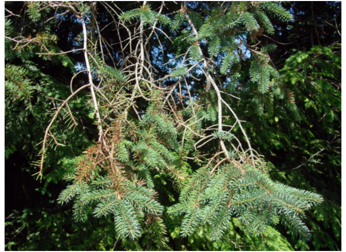
Photo 2. The first noticeable symptoms are browning of last year's needles and the death of some small branches.