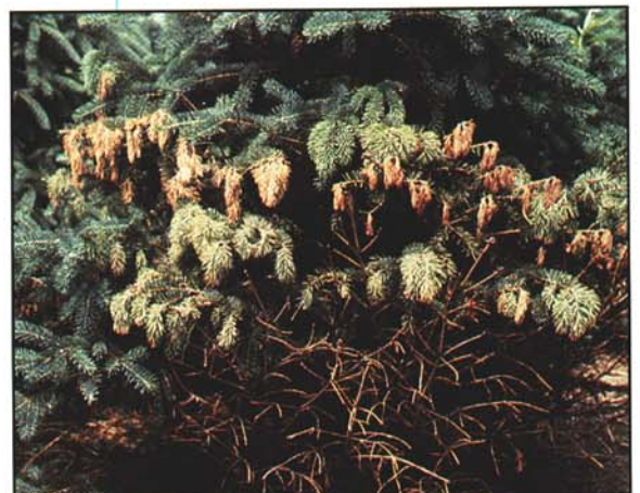
Figure 3. Symptoms of Phomopsis infection on a white spruce ( P. glauca ).

The most dramatic symptoms occur in spring as new shoots expand, then rapidly wilt and die. The wilted tips curl and often turn a char-