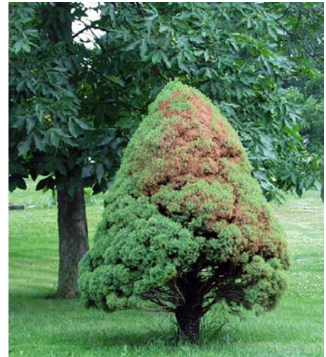
Spider mite injury on dwarf Alberta Spruce