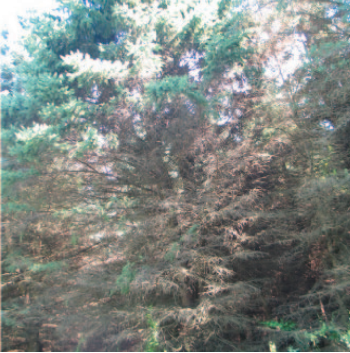
Fig 3: Spruce showing symptoms of decline.