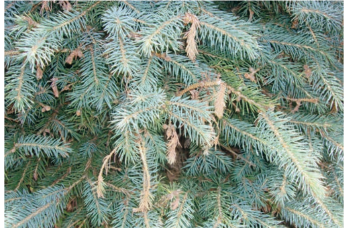
Figure 2. Phomopsis shoot (tip) blight of Colorado blue spruce observed in Wisconsin and Michigan nurseries and tree farms.

What is happening to our spruce trees? It appears that many of the spruce have, in near synchrony, begun to lose needles and branches from the bottom up (Figure 1). Depending on to whom you speak, some may call this needlecast, some may call it shoot blight (Figure 2) and still others may call it a canker disease. The reality is that they all may be right and they may all be wrong. Since spruce trees already have a common needlecast disease caused by Rhizosphaera , there is a good possibility that Rhizosphaera is on the needles of the trees and causing needle loss. Since there are at least two, maybe more, common shoot blights of spruce caused by Diplodia and Phomopsis , the shoot death that we are seeing could be caused by one or the other or both fungal pathogens. And, the branch death — could that be caused by the common canker disease of spruce called Cytospora canker? Yes, that is possible and even probable. We could end this article here by saying that some common diseases of spruce are intensifying due to unknown reasons, probably due to environmental circumstances, and spruce trees are dying or being taken down as the outcome. We could say that and be done with it. But, we don't believe that is the entire story.