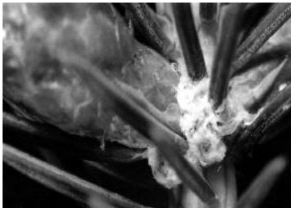
Egg Mass on Norway Spruce

The Eastern spruce gall aphid was introduced into the United States from Europe in the early 19th century. The insect primarily attacks Norway and white spruce , causing the formation of pineapple-shaped galls approximately one inch long at the base of developing twigs. The Eastern spruce gall aphid overwinters as immatures