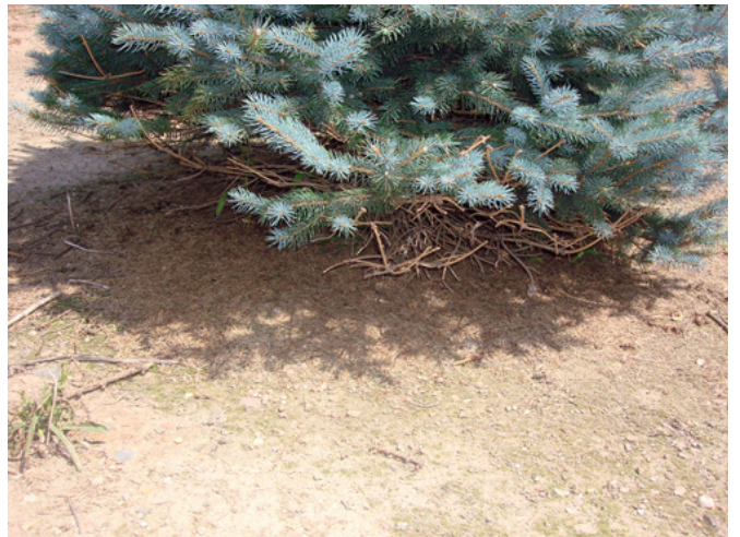
Photo 4. Continued Phomopsis infection will lead to the death of branches. Phomopsis is usually considered a stress pathogen.