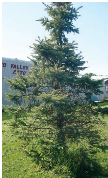
Figure 3. A much younger blue spruce than in Figure 1, located in Allendale with symptoms of thinning needles and some branch death. Lower branches were detached and taken back to the laboratory for diagnosis.

What's new about Phomopsis ? Phomopsis has been a rare visitor to the nurseries and tree farms in the state. The first major outbreaks were shoot blights (Figure 3) in Wisconsin in the 1980s and a decade later it was found in nurseries and trees farms in Michigan. In both cases, it was declared a different species than the one that our laboratory has been finding. To be fair, current DNA analyses take much of the guesswork out of identifying pathogens. Both Wisconsin and Michigan State University research laboratories used the best methods at the time to determine the species. Our laboratory simply sequences portions of the DNA to make comparisons based on the sequences of other species placed in the database. We are simply saying that the DNA sequences do not match up with their species determination, indicating they may have found a different species than the ones we are finding. If it is a new species, then we have a better case to make in saying this new Phomopsis is causing a new branch canker on mature and young spruce trees. But, if it does end up being the same, we need to rationalize how this disease of the spruce nursery and tree farm has moved out to the landscape and begun to cause infections of branches leading to unsightly landscape spruce trees.