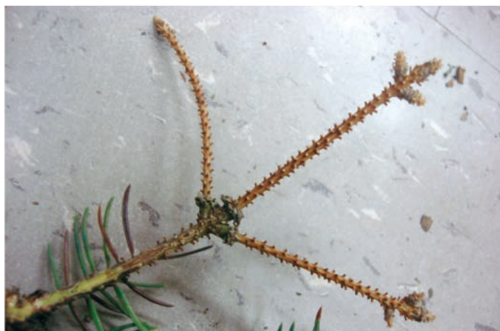
Figure 4. Phomopsis shoot blight can be found on the terminal end of the branches from the tree in Figure 2, indicating that Phomopsis can be found as a shoot blight on the trees in the landscape.

Koch's postulates is the name of the scientific test that plant pathologists use to determine if a microorganism can actually cause disease. We have tested a few of our strains and found