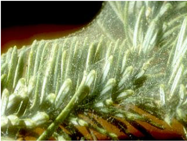
Webbing caused by spruce spider mite

In Pennsylvania, spruce spider mites have been found on 43 different conifer species but are most commonly found on the following plants: Abies (fir), Juniperus (juniper), Thuja (arborvitae), Tsuga (hemlock), Picea (Spruce) and Psuedotsuga (Douglas-fir).