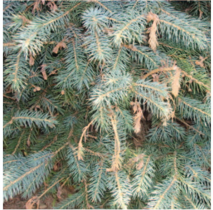
Fig 4: Typical Phomopsis symptoms on spruce.

Rhizosphaera and the newly invasive fungus that grows on the needles called Stigmina are also involved. We also know that, again like any good story or play, the characters are not who they first seem to be. Thanks to DNA analysis, we have found that the new fungus we have been calling Stigmina for the past several years is probably another species and is more closely related to the species of fungi causing brown spot needlecast of Scotch pine or Swiss needlecast of Douglas fir. We are also wondering if Phomopsis itself is the same Phomopsis we have seen before, or if it has changed and become more aggressive.