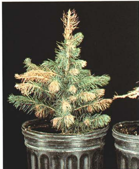
Figure 1. Colorado blue spruce ( Picea pungens glauca ) seedlings one month after inoculation with P. occulta .

The initial symptom of Phomopsis infection is a barely discernable chlorotic flecking of the needles.