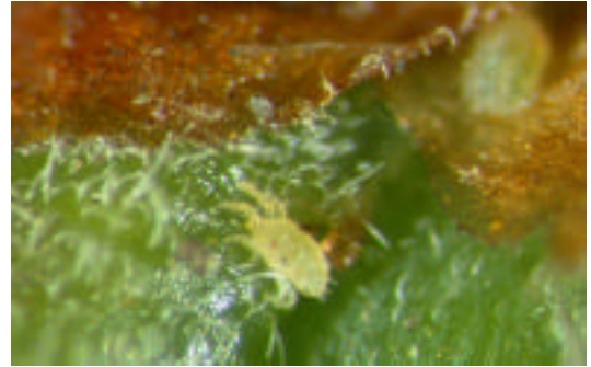
Adult spruce spider mite

The spruce spider mite, Oligonychus ununguis (Jacobi) is a common pest of landscape conifers in Pennsylvania. This tiny eight legged animal does best in the cool spring and fall weather with severe infestations causing discolored foliage, unthrifty looking plants and premature leaf drop. While feeding occurs in the fall and spring, often the damage does not become apparent until the heat of the summer.