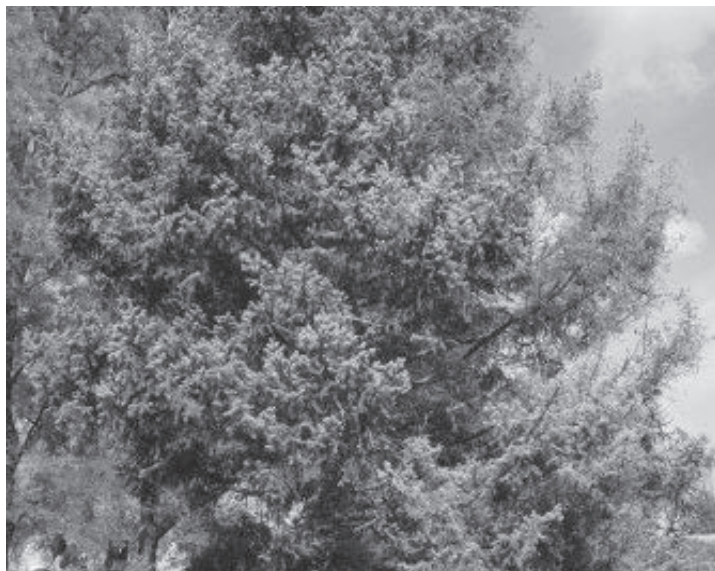
Fig 5: Symptoms can be found progressing toward the crown of the tree.