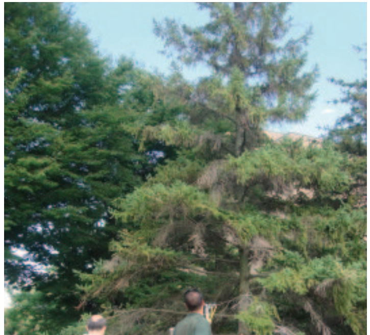
Fig 2: White spruce with dead branches from bottom to top.

After a trip to the tree farm, we saw at first what appeared to be extremely healthy spruce trees with some die back around the skirt of the trees rising up two or three whorls of branches in some cases (Figure 1). He had already culled many trees. It certainly could have been caused by Phomopsis canker based on the symptoms, and since the MSU Diagnostic Laboratory had already nailed down the pathogen we began to focus on the three major questions confronting the grower: Where did it come from? Why is it so severe? And, what can be done?