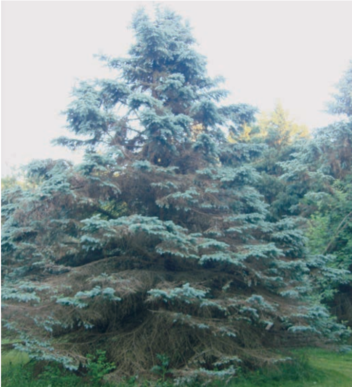
Figure 1. A 40-year-old Colorado blue spruce with the symptoms of Phomopsis spruce decline, which includes loss of needles and death of branches. The symptoms started on the lower portions of the tree and have worked their way up the tree.