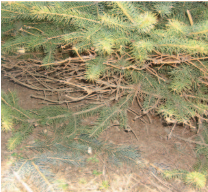
Fig 1: Spruce with die back around skirt.

Last fall we were asked to take some time to visit a tree farm in central Michigan and take a look at their blue spruce planting which was experiencing what we thought at the time was a unique problem. We were told the trees had been diagnosed with Phomopsis canker and the owner wanted to know where the disease came from, why it was so severe on his trees, and what he could do about it.