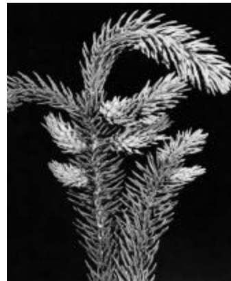
New galls on Norway Spruce Twig

The Eastern spruce gall aphid was introduced into the United States from Europe in the early 19th century. The insect primarily attacks Norway and white spruce , causing the formation of pineapple-shaped galls approximately one inch long at the base of developing twigs. The Eastern spruce gall aphid overwinters as immatures