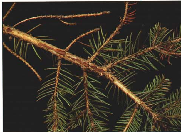
Figure 2. Phomopsis cankers are visible when outer bark is removed.

The discoloration is very subtle and may be difficult to distinguish from mite injury. Infection of the stems results in very small purplish lesions below the bark. These lesions are not visible in an intact branch and may cause no symptoms. The latent infections do not develop until the tree is stressed in some way, as under conditions of drought, flood, transplanting, or other root injury. Under such conditions symptoms develop in a period of three to four weeks.