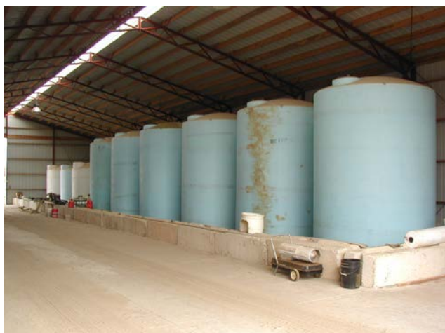
Inside view of the Blumenauer’s agrichemical storage building.

The agrichemical building has been a great addition to the Blumenauer’s farm operation. It allows them to store all their liquid fertilizer and chemicals inside, along with room to park their tandem-trailer grain hauling semi-truck inside.