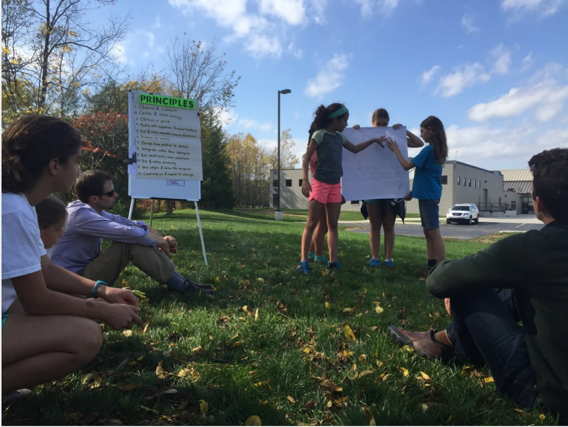
Photo: Students plan garden at Emerson School